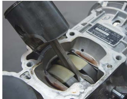
The pistons suffered only minor scuffing.