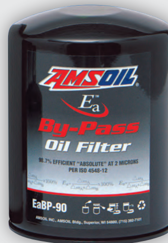
EaBP90 • EaBP100 • EaBP110 • EaBP120

AMSOIL Ea Bypass Oil Filters provide maximum filtration protection against wear and oil contamination. Working in conjunction with the engine's full-flow oil filter, AMSOIL Ea Bypass Filters operate by filtering oil on a "partial-flow" basis. They draw approximately 10 percent of the oil sump's capacity at any one time and trap the extremely small, wear-causing contaminants that full-flow filters can't remove. AMSOIL Ea Bypass Filters typically filter all of the oil in the system several times an hour, so the engine continuously receives analytically clean oil.