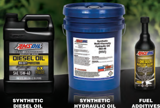
SYNTHETIC DIESEL OIL