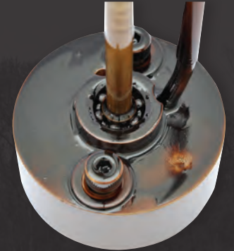
CONVENTIONAL HYDRAULIC OIL (ISO 46)