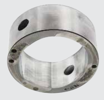
VANE PUMP CAM RING