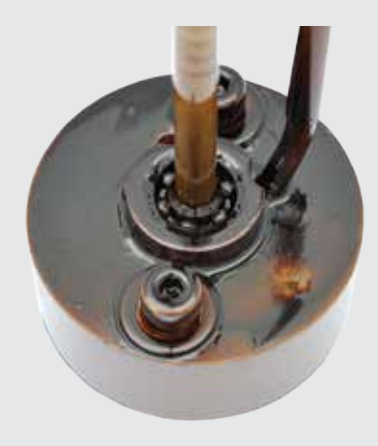
LEADING CONVENTIONAL HYDRAULIC FLUID (ISO 46)