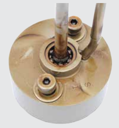
AMSOIL SYNTHETIC MULTI-VISCOSITY HYDRAULIC OIL (ISO 46)