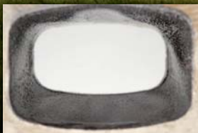
0% Port Blockage